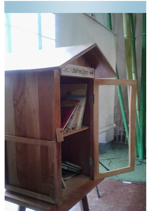
The Little Free Library given to the Museo Pambata which will serve as a model of many LFL to be created.