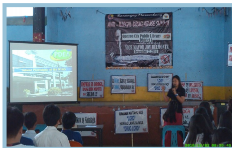
Seminar on Drug Abuse was conducted both in QCPL-Cubao (top photos) and QCPL -Masambong (right photos) which were both successful in integrating drug awareness to our High School Students.