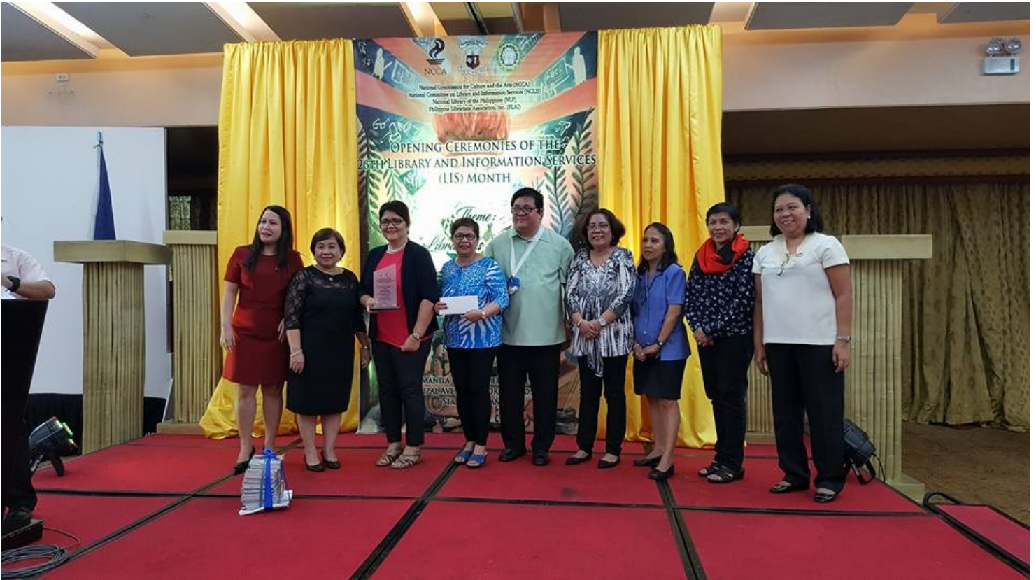
Awarding of 2016 Outstanding Public Libraries with Special Programs on Culture and Arts at the opening ceremony of the 26th Library and Information Services Month at the Manila Grand Opera Hotel in Sta. Cruz, Manila.

Joining a contest, especially if it involves the accomplishment of your organization is not an easy task. Evaluating, analyzing and assessing the programs and projects of the library on culture and arts for submission to the agency that spearheaded the contest, the National Library of the Philippines (NLP), National Commission for Culture and the Arts-National Committee on Library and Information Services (NCCA- NCLIS), and Philippine Librarians' Association Inc. ( PLAIA) somewhat need teamwork and hard work.