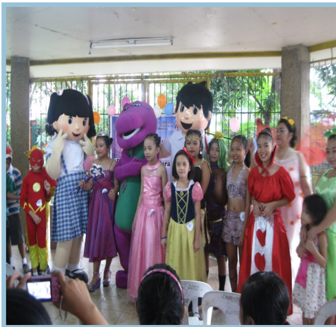
The participants and the staff giving their best shot of making the book characters come to life as they parade their best costumes in Brgy Masambong. Also part of the parade are QCPL’s Mascots led by Lib and Rary.