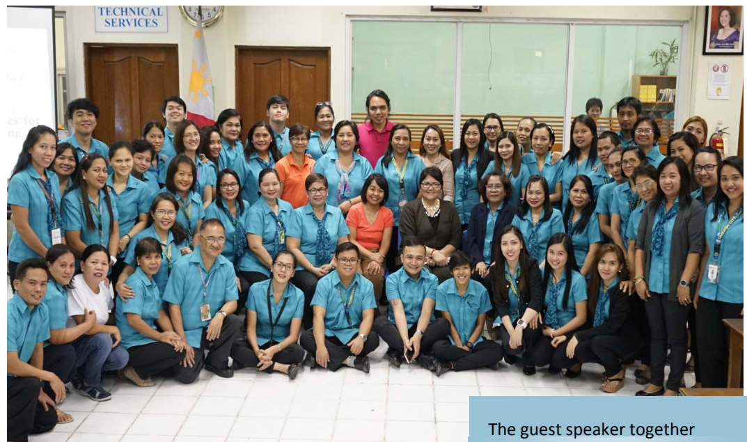
The guest speaker together with the attendees

Indeed, the seminar-workshop was a success and surprising to know that what the employees were doing to children during storytelling session is actually bibliotherapy in itself.